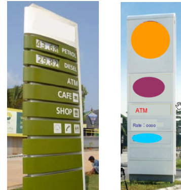
Main Identity display Signages

Paradigm was chosen to support them in the design of signage structures against a wind speed up to 111kmph, free of rattles and resonant effects for a life span of 10 years.